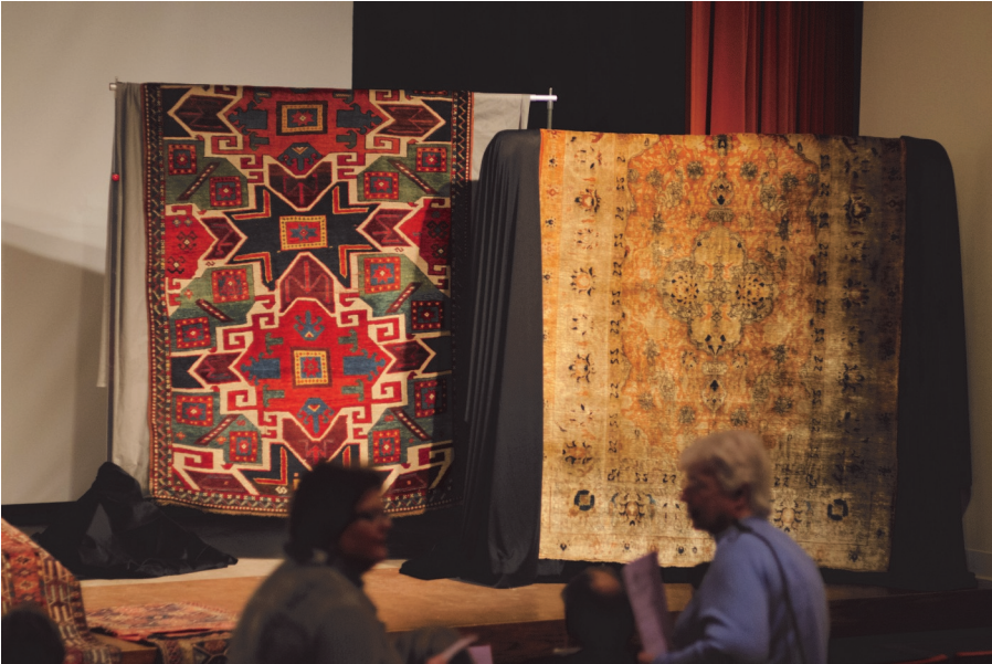
Left: Rugs from the Antiquarian's Heritage Collection on display at an Antiquarian Luncheon at the Neville Public Museum.