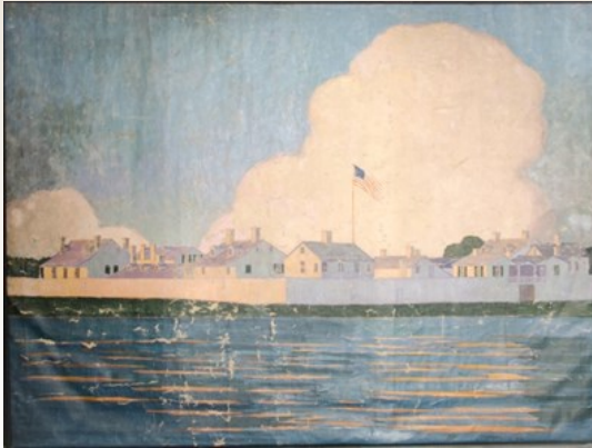
Painting of Fort Howard by B. Ostertac in 1899

This painting was commissioned by the Chicago and North Western Railway, which occupied the site of Fort Howard after it closed. Artist Blanche Ostertac, of Chicago, was hired for the job. It is said the painting was created from descriptions given by locals and old drawings of the fort. Ostertac completed the piece in 1899.