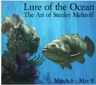
Lure of the Ocean March 6 - May 8

Initiated in 1942, the Art Annual is an important bridge between the artistic communities of NE Wisconsin and the Upper Peninsula of Michigan. This will be the 71st exhibition, which continues to connect generations through arts.