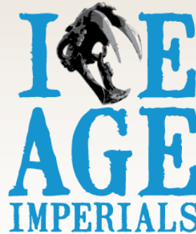
Ice Age Imperials May 27 - October 30