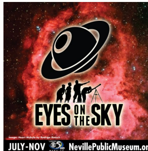
Eyes on the Sky July 16 - November 6

Discover the stories of Green Bay's nineteenth century military post, Fort Howard. Explore rare artifacts and first-hand accounts that tell the tales of life, lost love, murder and revenge at the Fort.