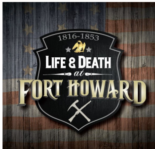
Life & Death at Fort Howard April 16, 2016 - April 9, 2017

Using two full-scale dioramas, a series of interactive displays and wall-mounted educational components, Ice Age provides a rare opportunity for visitors to interact with real fossils from ancient animals like the sabretooth cat, woolly mammoth, giant sloth, dire wolf, and giant beaver.