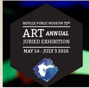
71st Art Annual May 14 - July 3

This traveling exhibit consists of 50 new paintings and sculptures by leading artists who specialize in the subject of cats.