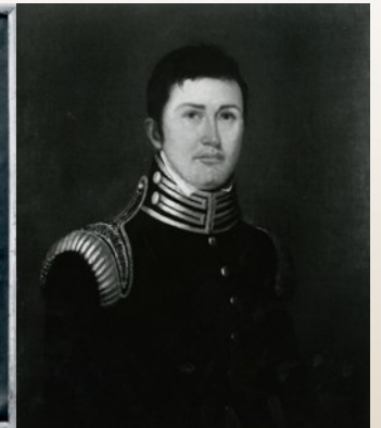
Portrait of Platt Rogers Green after Conservation

When the painting arrived in 1932 it was in very rough shape. It wasn't until 1979 that conservation was done on the painting. The museum has other artifacts from Lt. Platt Rogers Green which will make an appearance in the exhibit and future Exhibits Exposed programs!