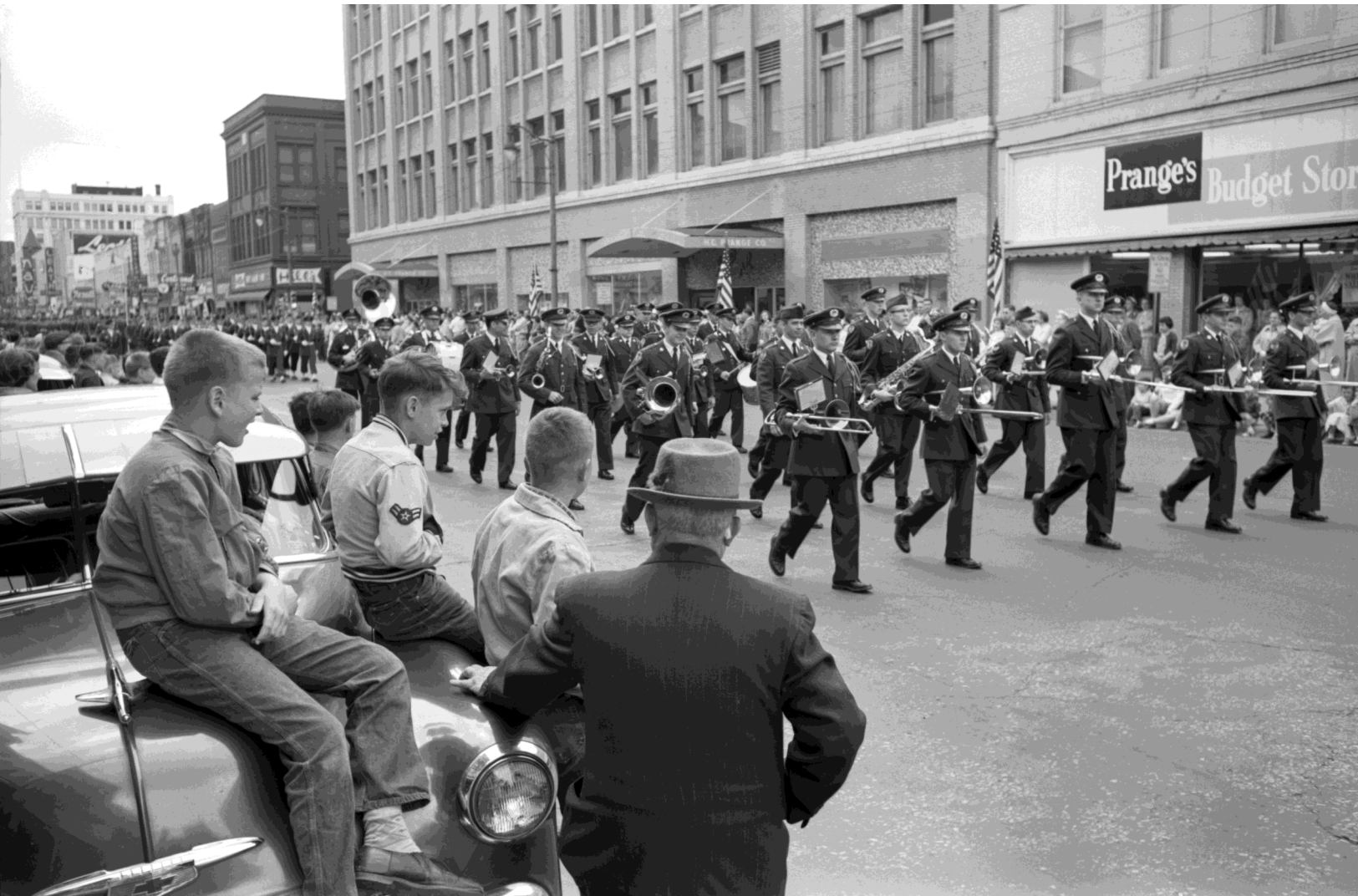
Above: Area residents line Washington Street for the Armed Forces Day parade held May 18, 1959. In the background is the H.C. Prange Company and Hill's Department Store.